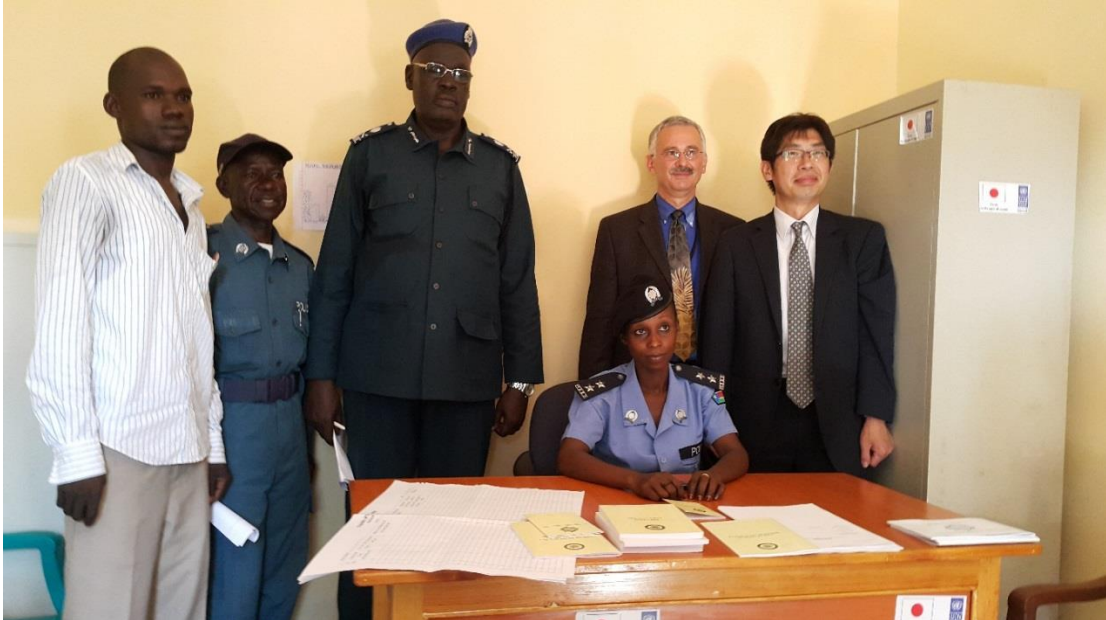
Special Protection Unit refurbished, provided with forms and law books and deployed with trained police personnel at Mukhtar Police Station, Wau, Western Bahr el Ghazal State

launch and handing over ceremony of equipment and furniture to the ECC. This acknowledgement was made by UNDP representatives at events as well as by senior Police leadership during their official remarks. Senior officials of the Japanese embassy were invited to make remarks. The logo “from the people of Japan” was affixed on the equipment and furniture items handed over to beneficiaries.