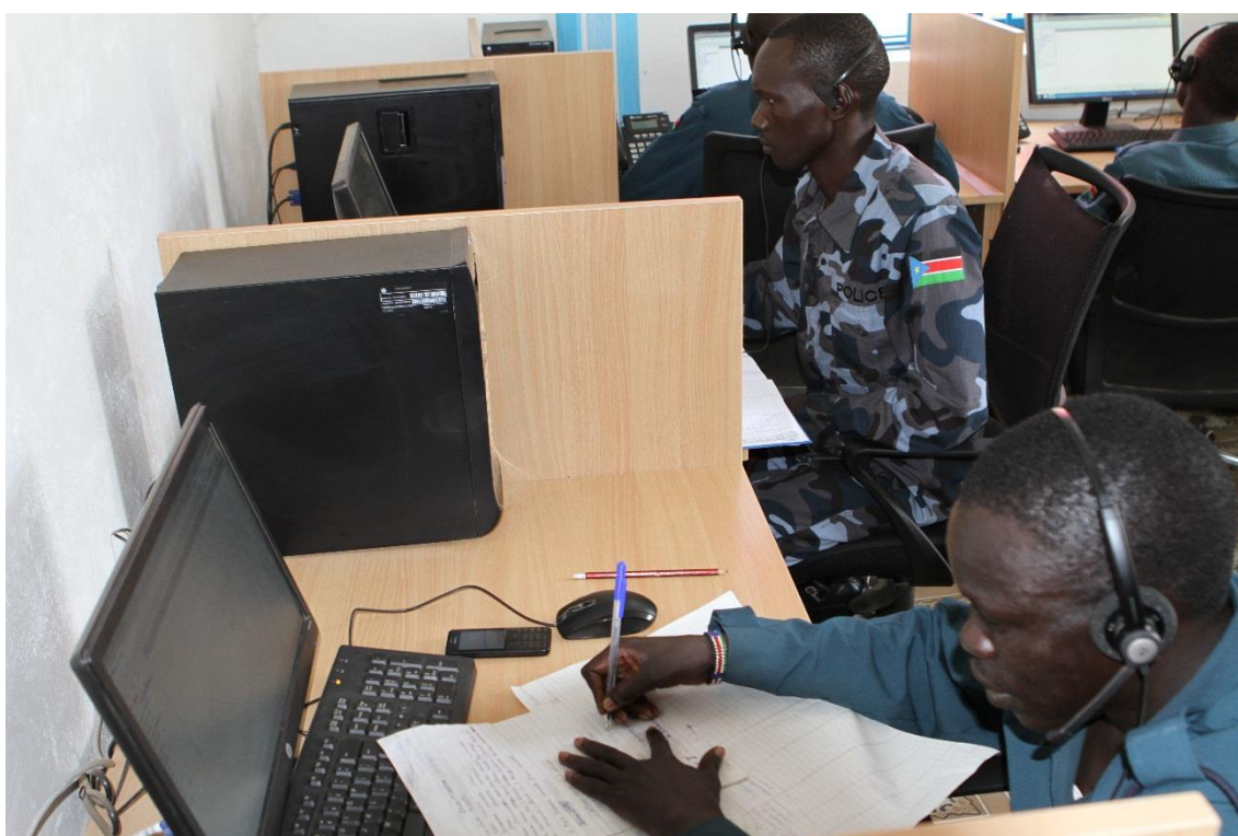
Police Respondents attending emergency calls at Emergency Call Center Juba, July 2015